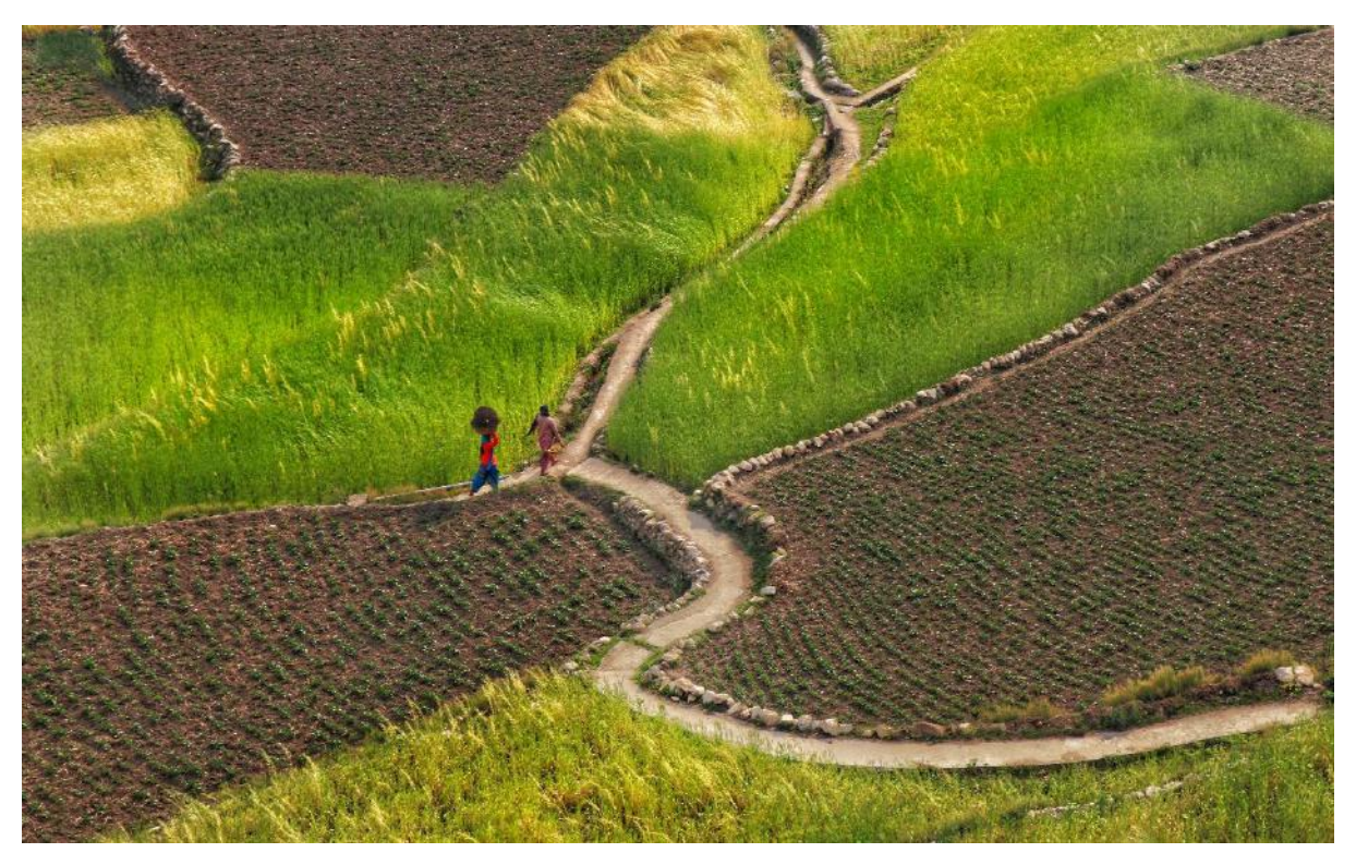
Consolation prize to the photo taken from Kausani, Almora, Uttarakhand