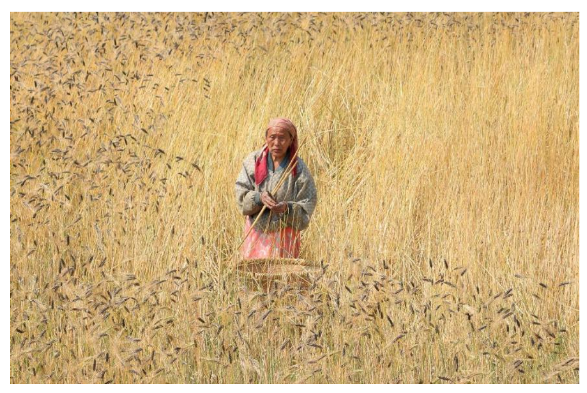
Third Prize to the photo of a Women collecting grains from the agriculture field of Sirkha village, Dharchula, Pithoragarh