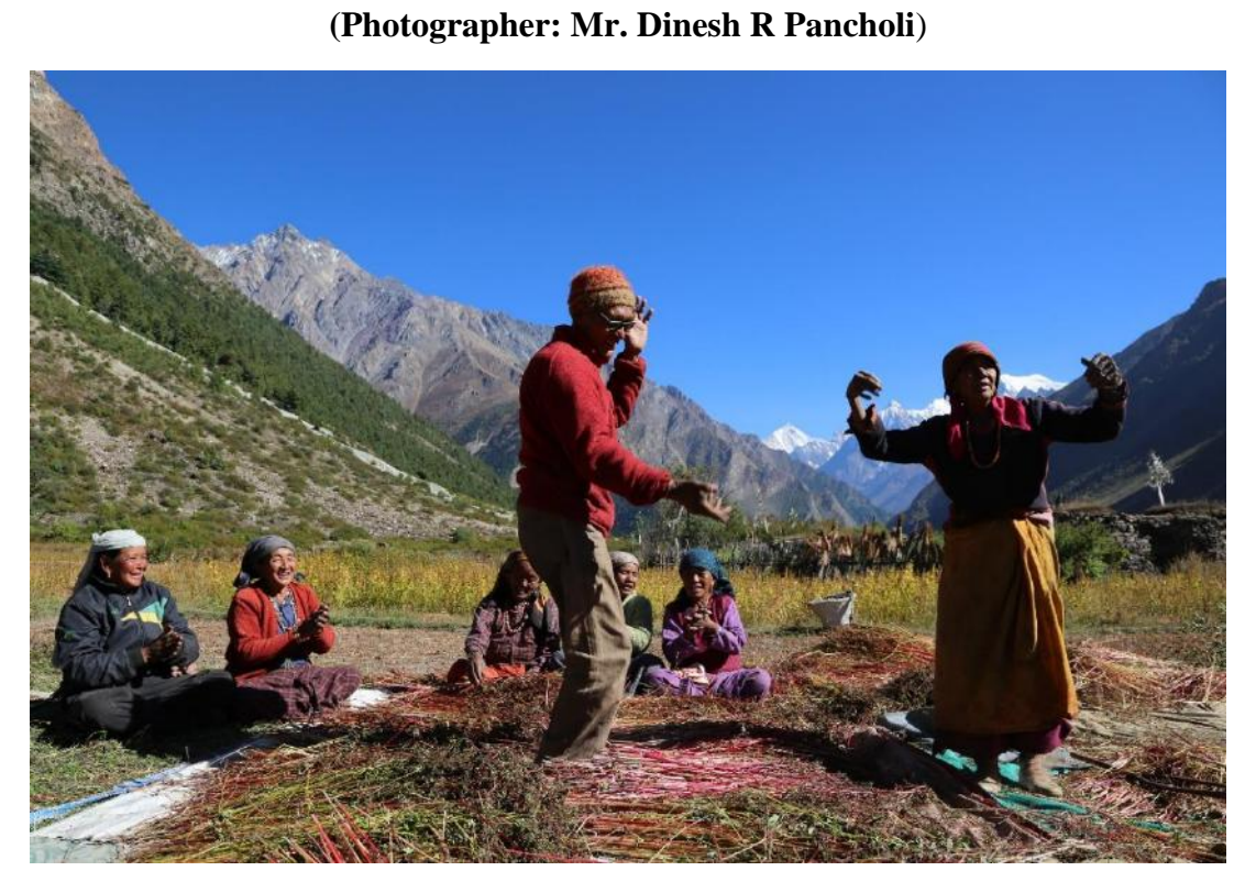
Second Prize to the photo of Indigenous people in Byas valley, Pithoragarh, Uttarakhand who are processing traditional grains