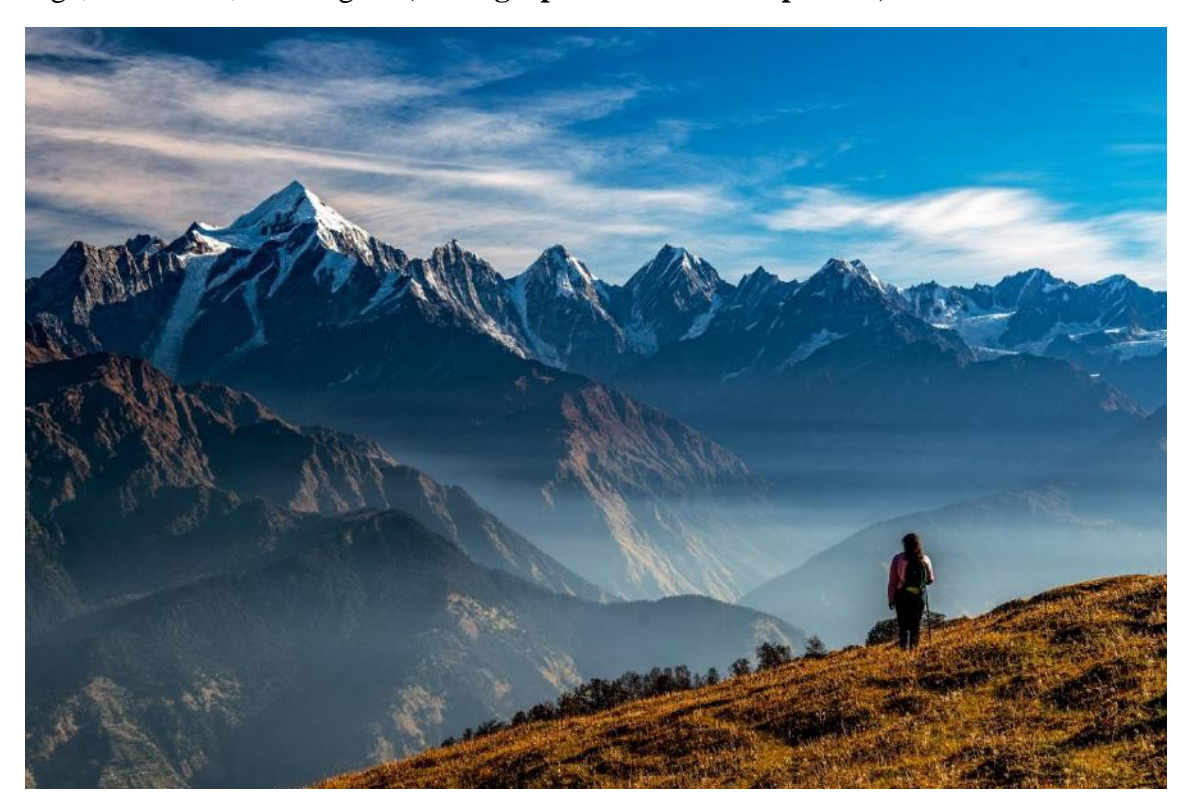
Consolation prize to the photo taken on the way to kaliya top Munsiyari