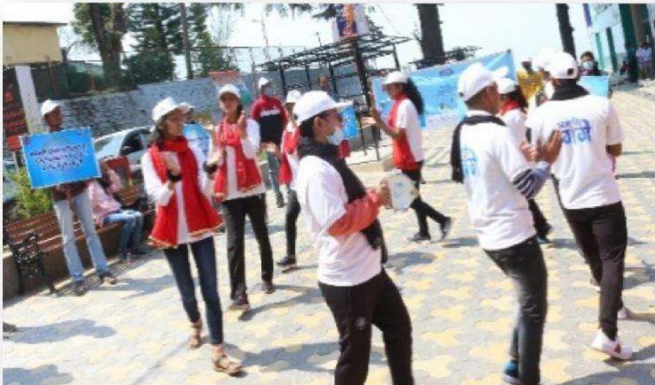
Fig: Glimpses of Namami Gange programme